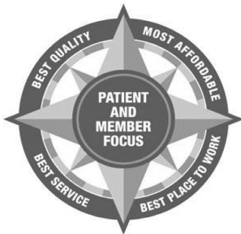
FIGURE 1 Kaiser Permanente Value Compass

As noted previously, honestly addressing difficult issues is essential to sustaining a successful partnership. And the partnership does face challenges. Leaders from both sides have deep experience in traditional labor-management settings and can attest that partnership is more demanding—personally and institutionally. For example, collective bargaining and decision-making processes can be slower and more taxing because more people are involved and more interests may need to be considered.